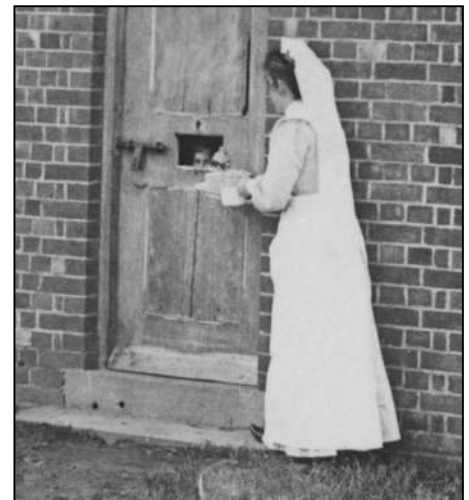
Plague quarantine 1900

He will be speaking about the third great pandemic of bubonic plague that swept around the world in the late 19 th century and arrived in Queensland in 1900. The book is a fictional reconstruction of what happened in Brisbane and Townsville, but it's been meticulously researched and the characters are real. Ian may reflect on the question: Are there many similarities between how the public reacts to these pandemics like the plague and swine flu?