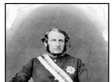
Governor Bowen – the first Governor of Queensland