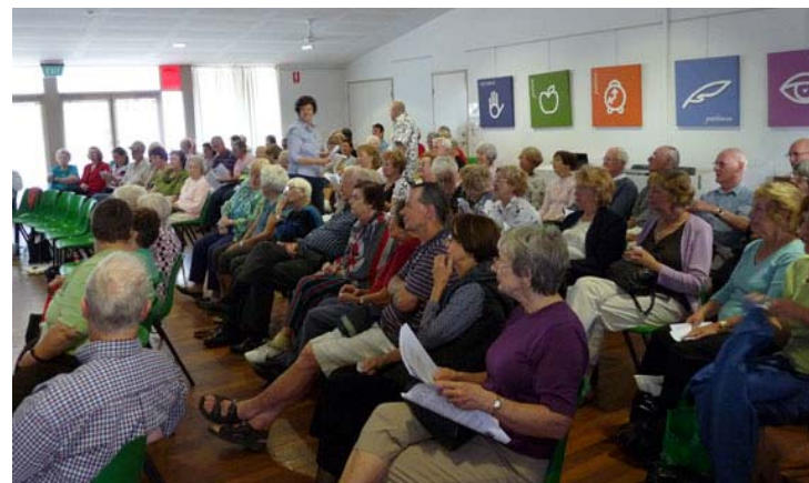
An interested and enthusiastic audience