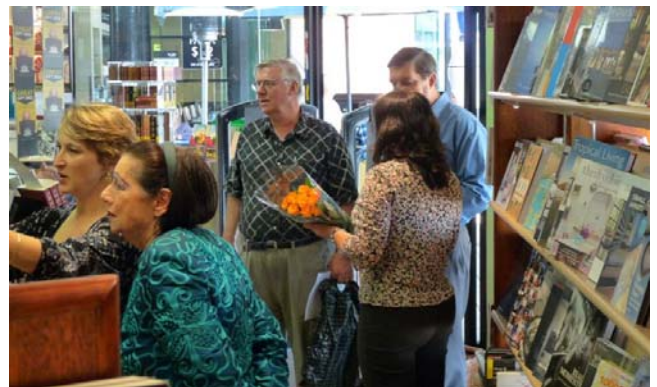
It was a very distinguished gathering.

NOTICE : Memberships for the 2009–2010 year are now due. You can pay in the Courtyard at the meeting or post your payment along with your details on the membership form to the Secretary. Not sure if your membership is current? Come and see one of your friendly Committee members on the day to check.