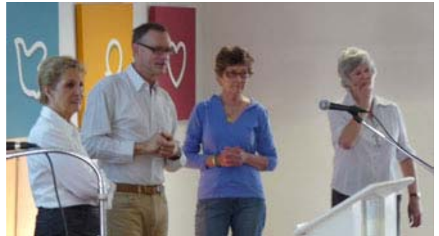
The G50 Committee

A permanent record of the meeting and the celebration is being produced by the Committee. Not just for locals, but even for those outside the cherished intimacy of Glenfalloch; it will make fascinating reading.